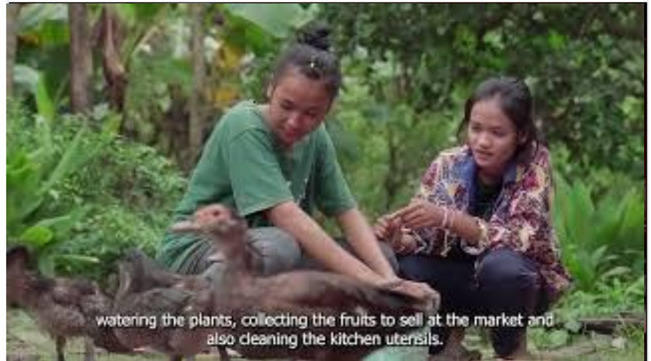
watering the plants, collecting the fruits to sell at the market and also cleaning the kitchen utensils.

We zijn heel trots op ze! Ze zijn een voorbeeld en inspiratie voor alle kinderen en studenten in ons community centrum.