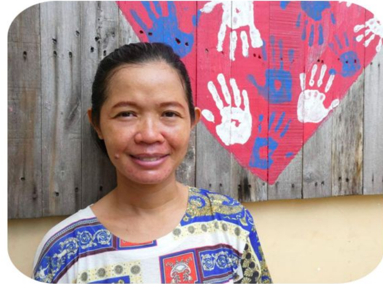
Fondswerving COLT Cambodja

In line with COLT's long-term vision, the empowerment of the local population is high on the list of priorities. All stakeholders in COLT's organization ultimately have the goal that both the center and the community it supports become increasingly self-sufficient. Mobilizing local support and fundraising is an important part of this development.